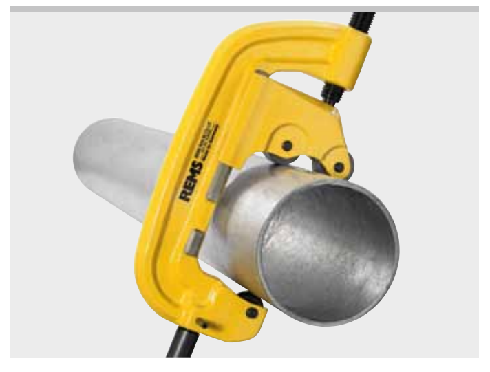
German Quality Products

Only 1 cutter wheel for pipes Ø \frac{1}{6} -4" (10–115 mm), wall thickness s ≤ 8 mm, suitable for both pipe cutters. Cutter wheel for pipes Ø 1–4" to wall thickness s ≤ 12.5 mm available as accessory.